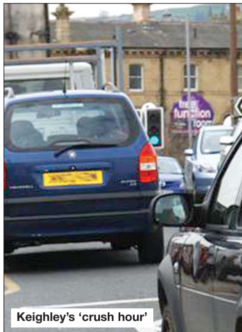
Keighley's 'crush hour'

"We will be asking the officers also to focus on other problem areas, especially those near schools."