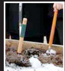
Who's digging in – and why? - Pg 7