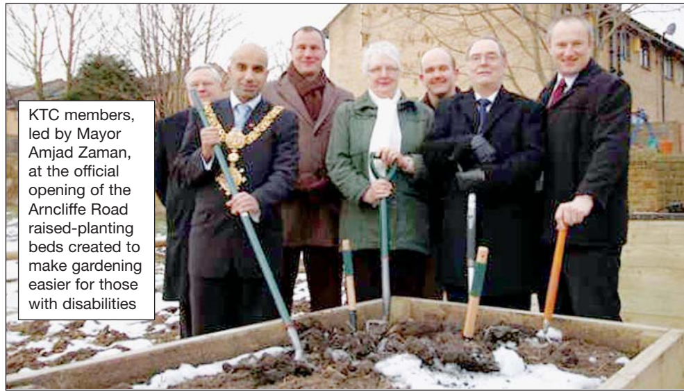
KTC members, led by Mayor Amjad Zaman, at the official opening of the Arncliffe Road raised-planting beds created to make gardening easier for those with disabilities

■ A further £10,000 from the lottery is funding creation of the Damems Nature Trail – a path with seats and viewing areas based on a disused footpath alongside the Keighley & Worth Valley